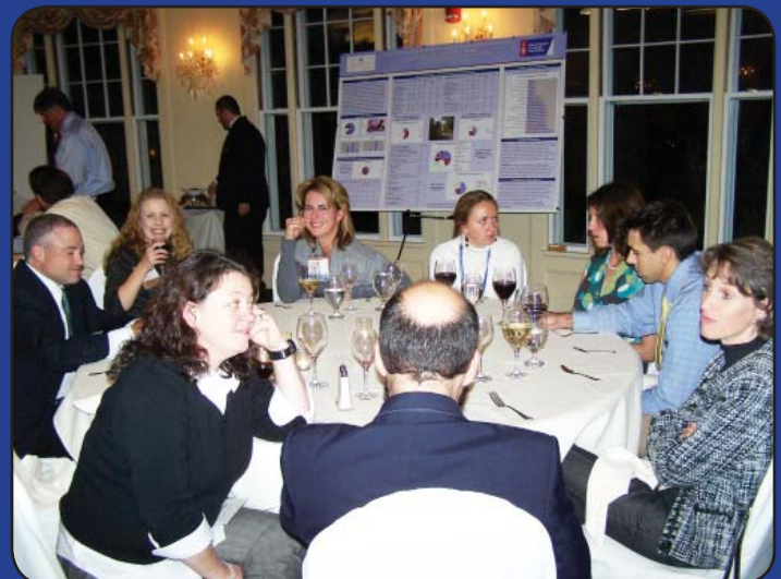
The NNECOS Networking Lounge was abuzz with conversation throughout the weekend.